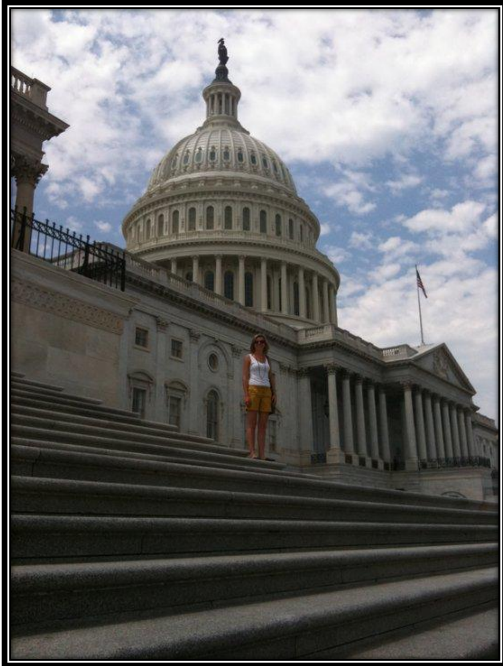
On the steps of the House of Representatives on Capitol Hill.