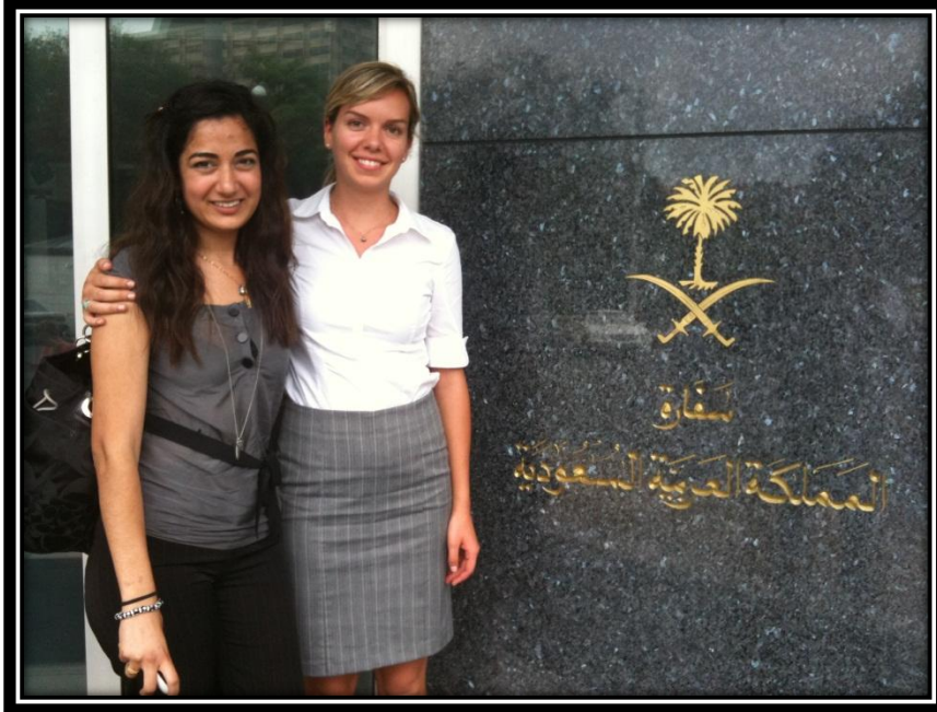
Visiting the Saudi Arabian Embassy with the Washington Center—International Affairs Program.